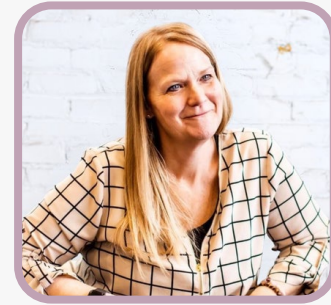
SANDI LUCK BULLY BREW